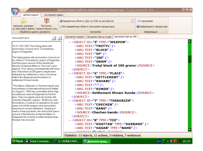
Figure 3. An example of XML file for the semantic structure presentation.

An example of XML file is given in Figure 3.